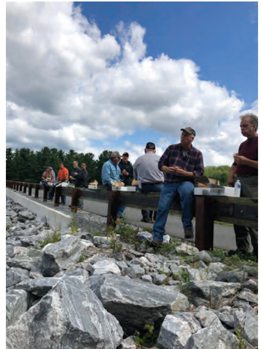
A splendid lookout at Nepaug for lunch.